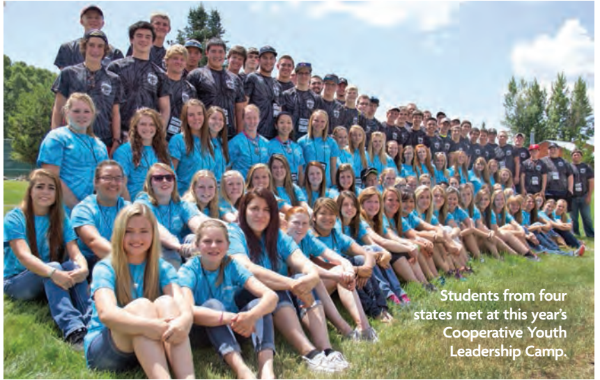
Students from four states met at this year's Cooperative Youth Leadership Camp.

For additional information contact LJEC at 888-796-6111 or visit www.ljec.coop