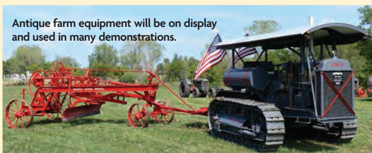
Antique farm equipment will be on display and used in many demonstrations.

This event helps to keep alive the art of planting, harvesting, threshing and storing of grain forage crops along with the domestic arts, tools, implements, instruments and machinery showing the culture of pioneer days. The educational and historical exhibits and displays are illustrated through reenactments with working machinery.