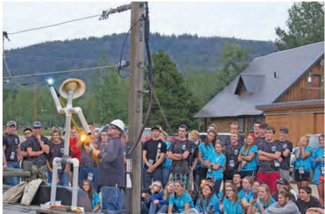
Local linemen gave a high voltage safety demonstration to teach campers about safety around power lines.