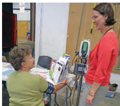
Volunteers assist members with blood pressure (above) and cholesterol testing (below).