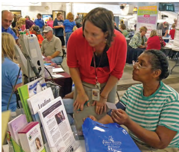
Volunteers from Lawrence Memorial Hospital help LJEC members understand test results and distribute educational information.

Other attendees include: Holland Eye Clinic, McLouth Dental, A&D Hearing Center, McLouth Emergency Services, Phillips Insurance, First Bank & Trust and many more. In addition, Sam's Club will be in atten-