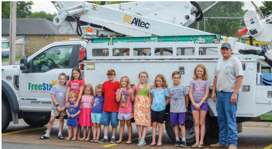
Youth attending Auburn Community Library's Storytime learned about "power" for the week's theme of the letter "P"