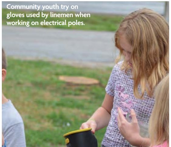
Community youth try on gloves used by linemen when working on electrical poles.