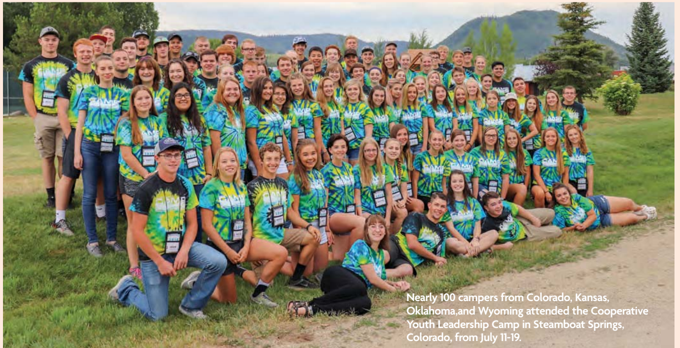
Nearly 100 campers from Colorado, Kansas, Oklahoma, and Wyoming attended the Cooperative Youth Leadership Camp in Steamboat Springs, Colorado, from July 11-19.