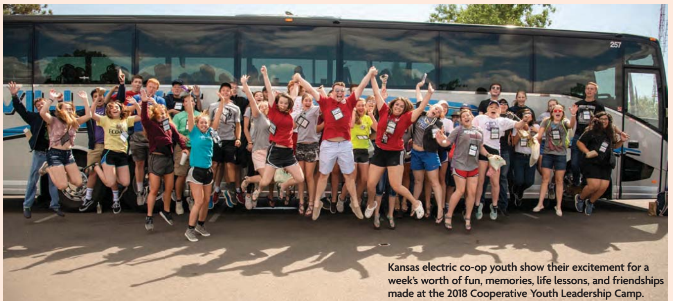
Kansas electric co-op youth show their excitement for a week's worth of fun, memories, life lessons, and friendships made at the 2018 Cooperative Youth Leadership Camp.

Unfortunately, camp was over almost as soon as it started. There were a lot of heartfelt goodbyes as friends I had made throughout the week had to leave. While leaving was hard, it doesn't change the fact that the Cooperative Youth Leadership Camp was an experience that I will remember for a lifetime.