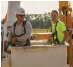
On the first day of Youth Tour, Kaw Valley linemen give safety demonstrations and bucket truck rides to teach delegates about electric cooperatives.

After learning about their co-ops, delegates traveled to Washington, D.C., to join more than 1,700 high school students from across the nation. During their week-long stay in Washington, D.C., the students had the chance to visit with their congressional representatives. They also had the opportunity to tour the Capitol, Smithsonian Institute, Mt. Vernon and the many memorials.