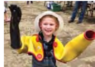
A young student dons rubber gloves as part of the electricity safety display at Fort Leavenworth.