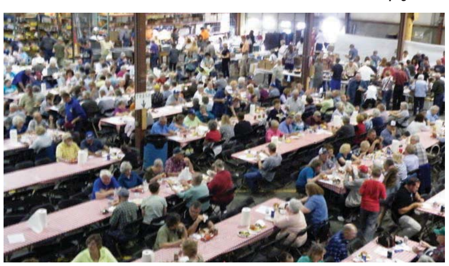
A large crowd of members and guests enjoyed a barbecue dinner on April 1.