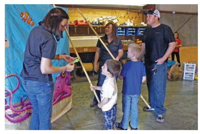
Children fishing for prizes in the "Fish Pond."

size, number of members served, number of employees and we both serve a primarily residential membership. We have used these things to our advantage as we continue to examine how we can best serve you while maintaining the reliability you