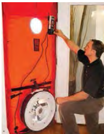
A blower door is used to measure the airtightness in a building.

LJEC offers a blower door test that can calculate how much air leakage you have in your home. This test consists of a door (with a fan at the bottom) that mounts to the frame of an exterior door. The fan will either pressurize or de-pressurize the home, creating air pressure differences. A pressure gauge is used to measure the differences between inside and outside the home and a pressure and airflow gauge.