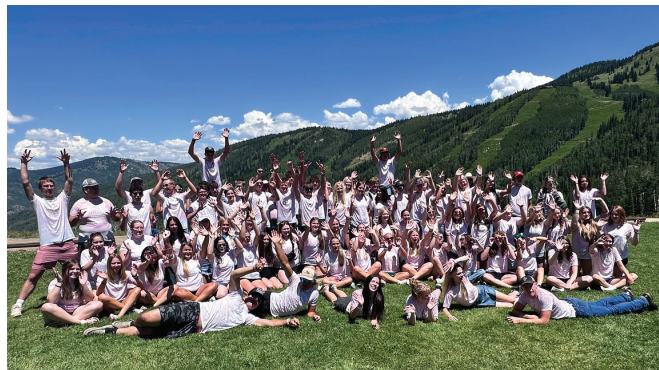
The camp brought together 77 high school student leaders from Kansas, Oklahoma, Colorado and Wyoming sponsored by 45 electric and agriculture cooperatives.