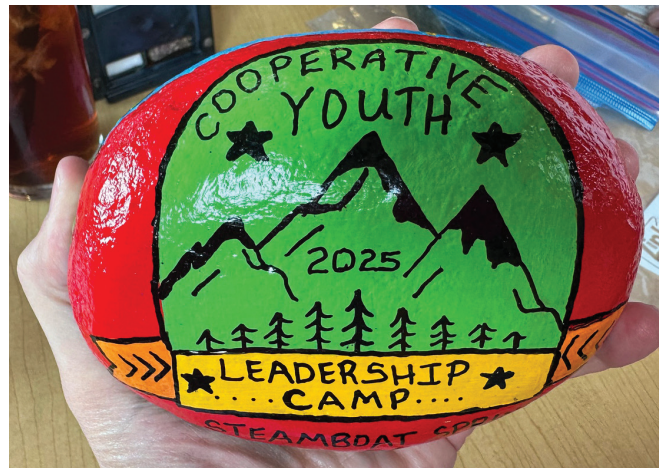
The 48th Annual Cooperative Youth Leadership Camp (CYLC) was held July 11-17 near scenic Steamboat Springs, Colorado.