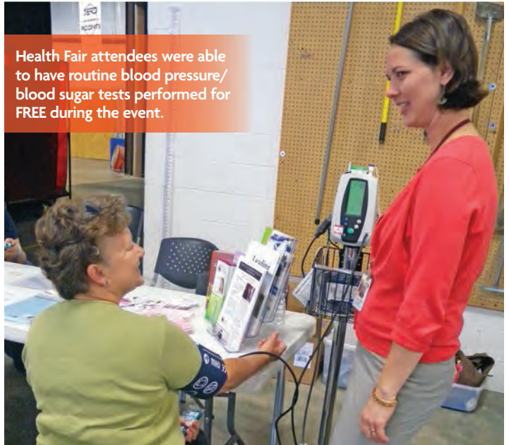
Health Fair attendees were able to have routine blood pressure/blood sugar tests performed for FREE during the event.

LJEC members were also treated to a free meal, courtesy of the cooperative. This is our thanks for