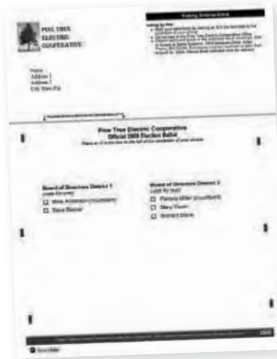
LJEC members can cast their votes at Annual Meeting or on the mail-in ballot, similar to this one, prior to the meeting.

To improve member engagement, the LJEC Board of Directors