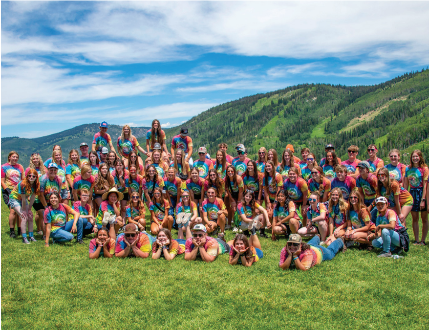
The 2023 Cooperative Youth Leadership Camp delegates gather for a group photo near Steamboat Springs, Colorado. CYLC included 43 student leaders from Kansas, Oklahoma, Colorado and Wyoming, sponsored by 25 participating cooperatives.