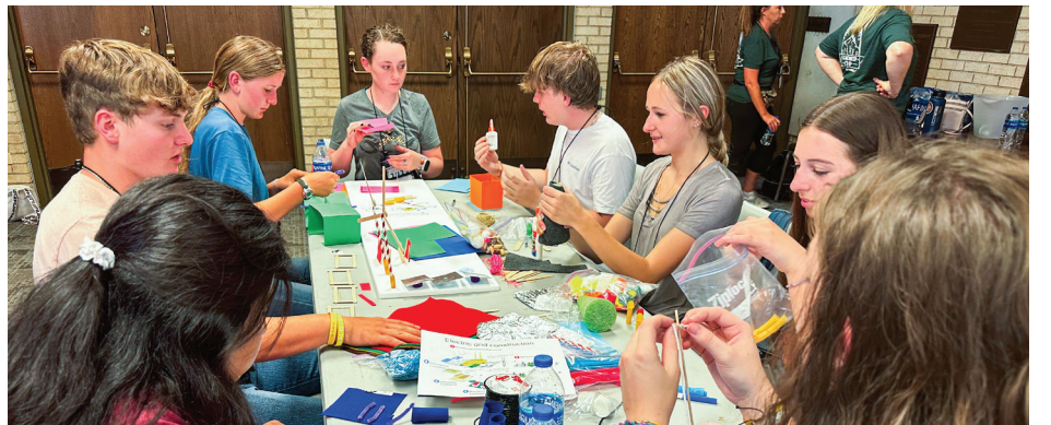
Groups built electric grids using craft supplies to learn how electricity works.