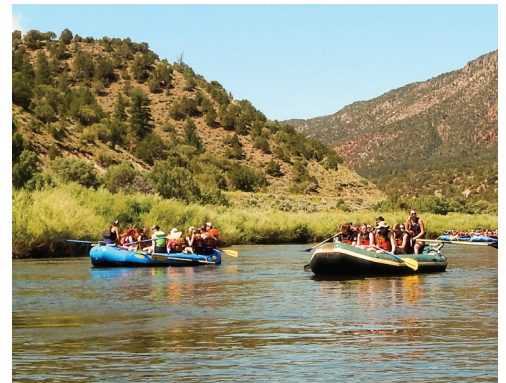
Rafting down the Colorado River is a highlight of the trip for campers.