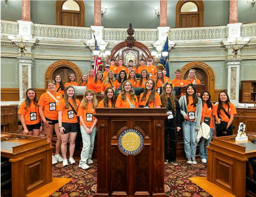
The 2023 Electric Cooperative Youth Tour delegates gather at the Kansas State Capitol in Topeka for a private evening tour before taking off for D.C.