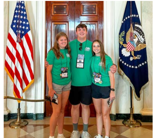
Visiting the White House was one of the highlights of the trip.