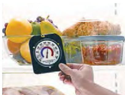
Keep food during a power outage by monitoring the temperature

During cold months, it may be tempting to store food outside. Although this may work for cold drinks, food can spoil in direct sunlight. Curious animals may also take advantage of an outside stash.