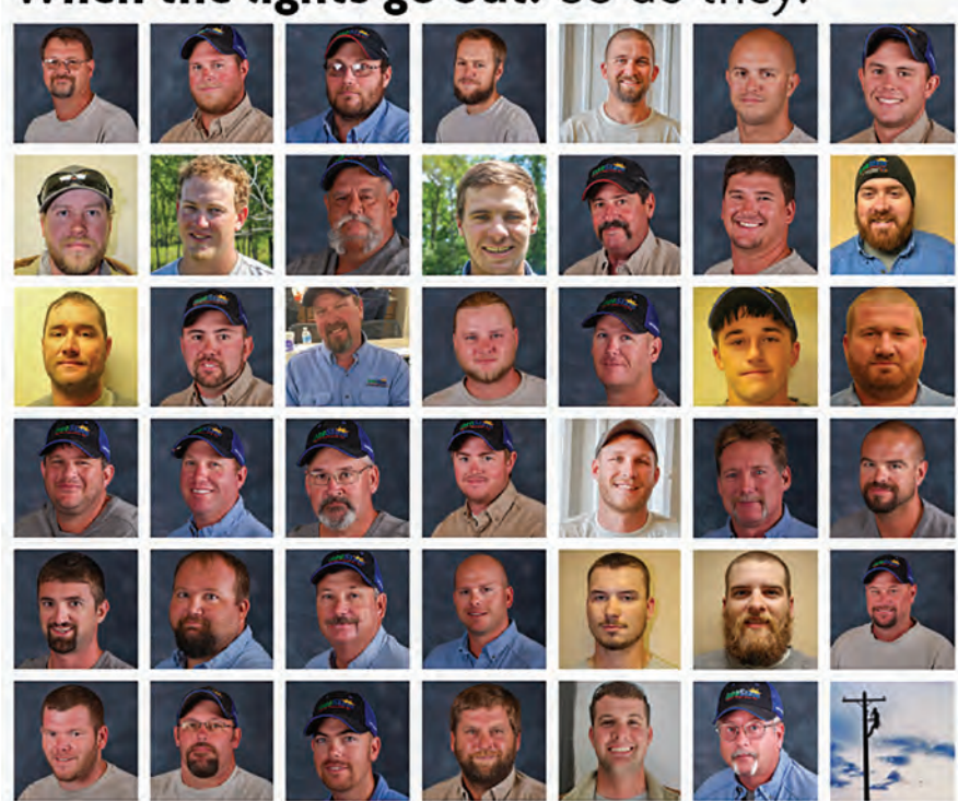
Lineworker Appreciation Day April 8, 2019