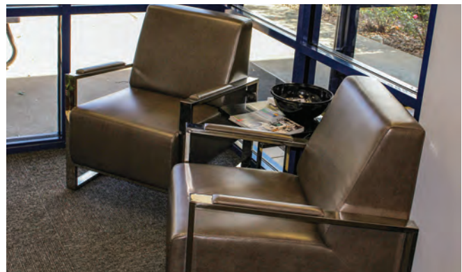
Left: Impact resistant glass windows were added to the McLouth lobby area for extra protection. The updated lobby also has a television that provides announcements and information on co-op matters, programs, and events. Right: The lobby area includes a place for members to sit and complete forms, or wait for assistance. The area now includes restricted building access to ensure safety of staff and visitors.

Every year 2 million Americans report having experienced some form of workplace violence. FreeState wants to ensure no employee is part of that alarming statistic.