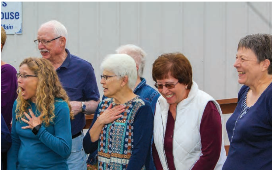
The emotion was palpable as FreeState leadership presented a check for more than $10,000 to God's Storehouse in Meriden. Although the pantry knew it had been selected to receive Sharing Success funding, they had no idea how much was raised.

FreeState's trustees selected God's Storehouse after an application process. The board determined the food pantry to be the designated organization in June, and the trustees challenged