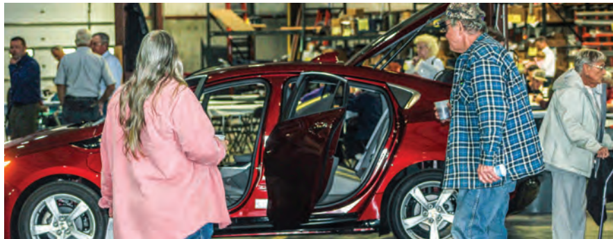
Above: Members had the chance to check out the Chevrolet Volt at the Energy Fair. The car is part electric and part gasoline. Right: A Kansas Energy Program demo shows examples of energy powering different types of light bulbs. Ten vendors provided information.