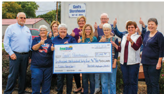
A big thumbs up after FreeState presented a donation to God's Storehouse to be used to help those in need this holiday season.

For more information on how organizations can apply for the CoBank funding, call the office or visit the co-op website at www.freestate.coop . The deadline to apply is May 1, 2019.