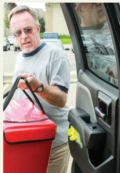
A Meals on Wheels employee packs hot and cold boxes into the Kaw Valley truck for delivery in southwest Topeka.