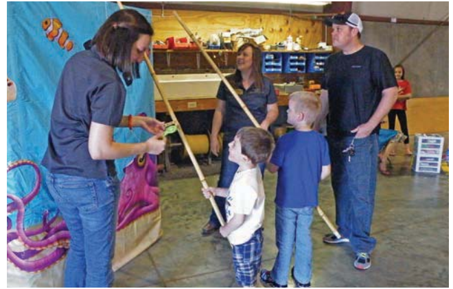
Children fishing for prizes in the "Fish Pond."

If each membership, Kaw Valley and LJEC, votes in favor, we are