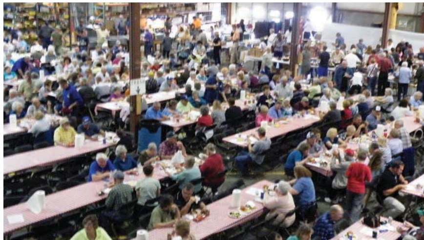
A large crowd of members and guests enjoyed a barbecue dinner on April 1.