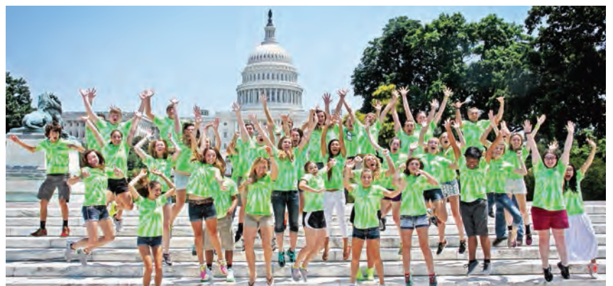
Students from Kansas will join more than 1,600 youth to attend the Electric Co-op Youth Tour June 11-18, 2015.