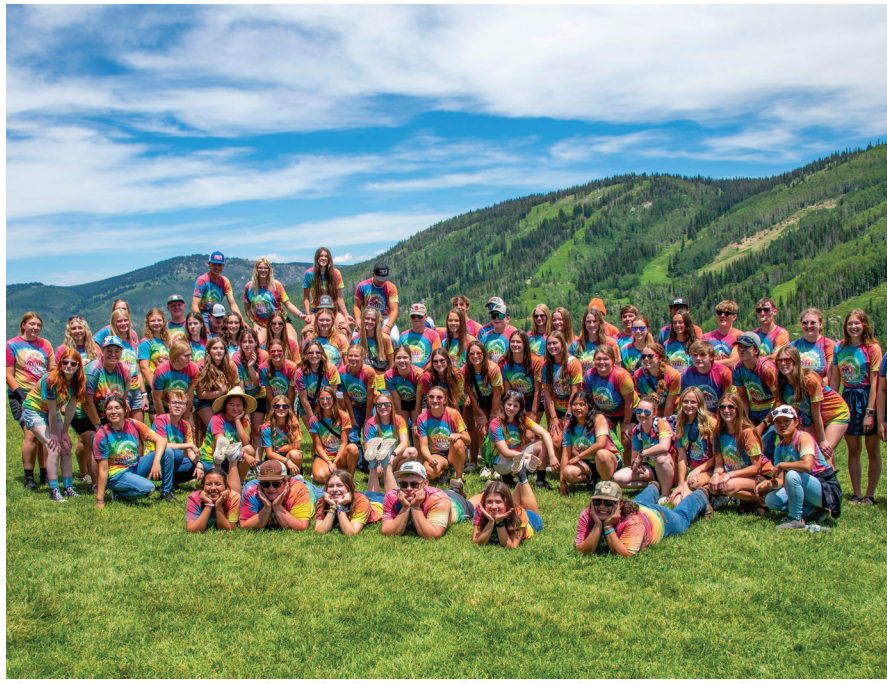
The 2023 Cooperative Youth Leadership Camp delegates gather for a group photo near Steamboat Springs, Colorado. CYLC included 43 student leaders from Kansas, Oklahoma, Colorado and Wyoming, sponsored by 25 participating cooperatives.