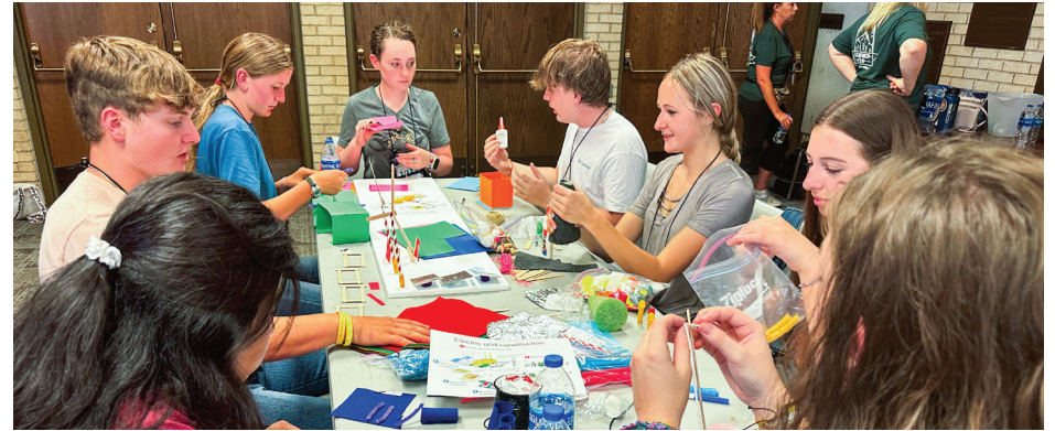
Groups built electric grids using craft supplies to learn how electricity works.