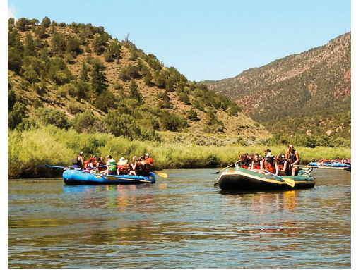
Rafting down the Colorado River is a highlight of the trip for campers.