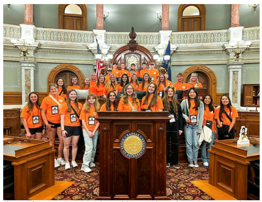
The 2023 Electric Cooperative Youth Tour delegates gather at the Kansas State Capitol in Topeka for a private evening tour before taking off for D.C.