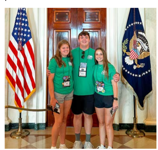
Visiting the White House was one of the highlights of the trip.