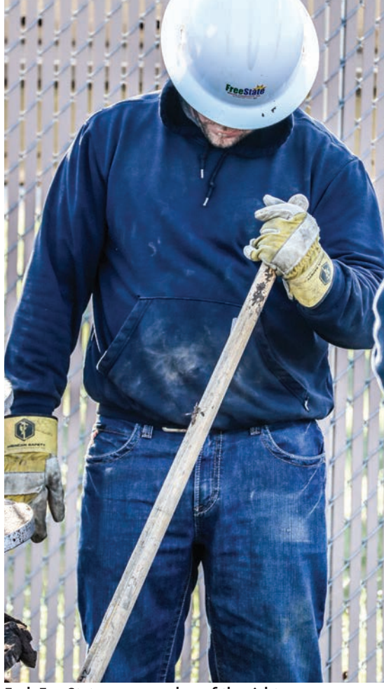
Each FreeState crew member of the rightof-way department works diligently to keep your lights on.

Our tree crew is dedicated full-time to maintaining the FreeState system, clearing debris during outages and taking precautionary and proactive